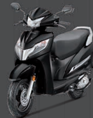
PEARL NIGHT STAR BLACK