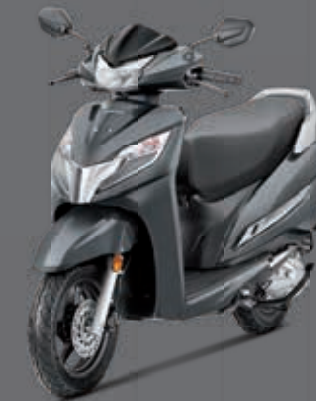
HEAVY GRAY METALLIC